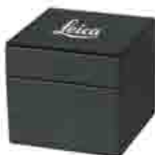
7 Individual Logo printing Individueller Logo druck Pression de logo individuelle € 5,00