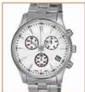
8051STM from €109