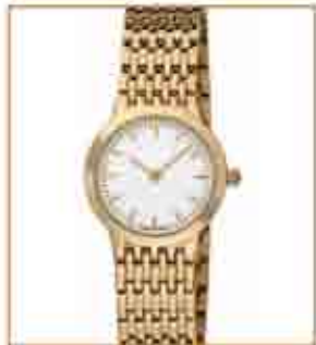
8070PLM from €103