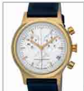
8060PLL from €109