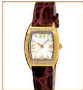
8035PLL from €76