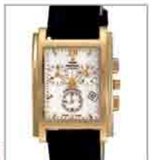
8006PLL from €103