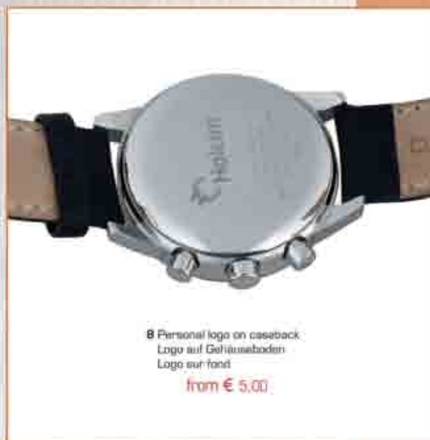
8 Personal logo on caseback Logo auf Gehäuseboden Logo sur fond from € 5.00