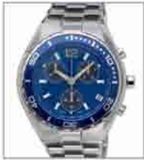
8037STM from €130