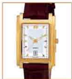
8004PLL from €71