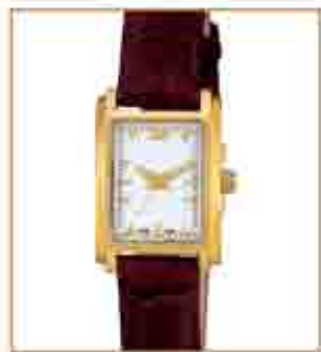
8005PLL from €71