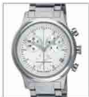
8060STM from €115

Chronographe • Boîtier acier ou plaqué • Étanche 50 m • Mouvement quartz • Date • Bracelet cuir ou acier solide