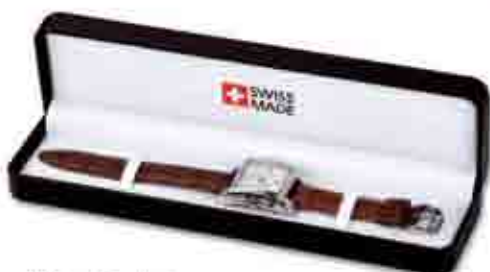
5 Deluxe Box black Deluxe Etui schwarz Etui deluxe noir € 5,00