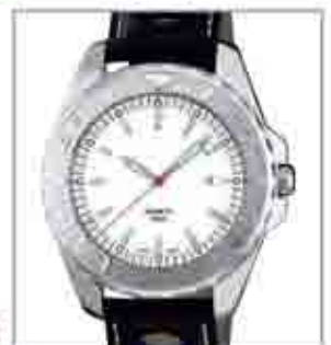
80255TL from €54