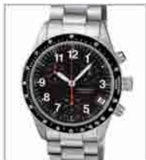
8009STM from €95

Chronographe • Boîtier acier • Étanche 50 m • Mouvement quartz • Date • Bracelet acier ou cuir