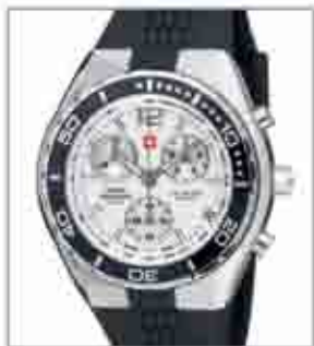
8037STRUB from €99

Chronograph • Stainless steel case • 100 m water-resistant • Quartz movement • Date • Leather, rubber strap or solid stainless steel bracelet