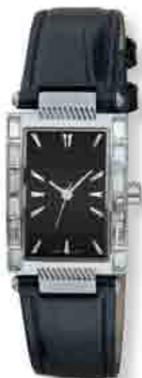
8071STL (1:1) from €89