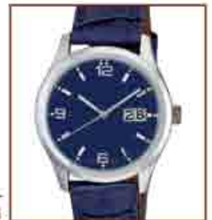
2601STL from €56