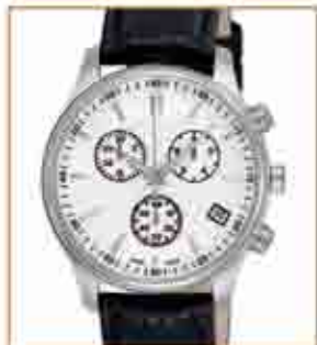
8051STL from €89