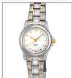
7982BIM from €58