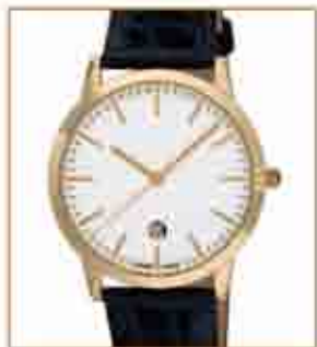
8068PLL from €84