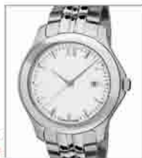
8065STM from €79