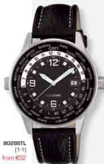
80295STL (1-1) from €92