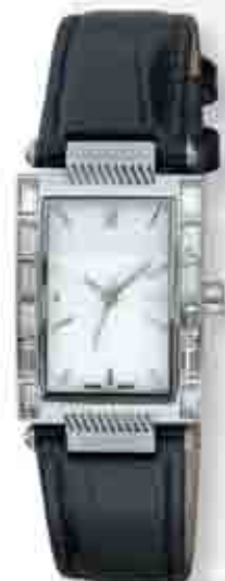
8071STL (1:1) from €89