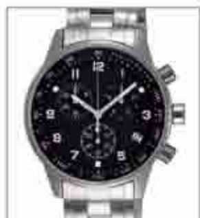
8054STM from €110

Chronographe • Boîtier acier • Étanche 50 m • Mouvement quartz • Date • Bracelet acier ou cuir