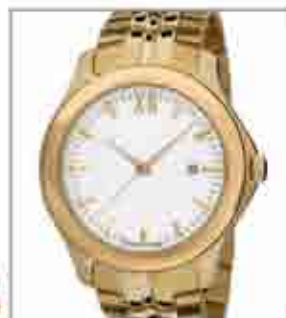
8065PLM from €99