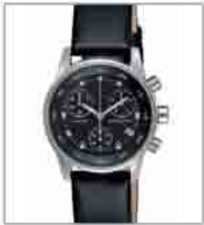
80405TL [Lady] from €92