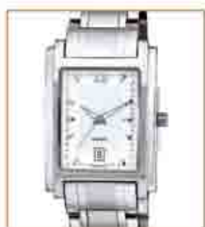
8004STM from €81

Boitier acier, bicolor ou plaqué • Etanche 30 m • Mouvement quartz • Date (montre homme) • Braslet cuir ou acier solid