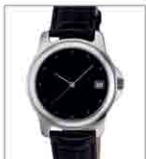
2419STL from €38

Stainless steel case • 50 m water-resistant • Quartz movement • Date • Leather or rubber strap Edelstahlgehäuse • 50 m wasserdicht • Quarzwerk • Datum • Lederband oder Kautschukband Boîtier acier • Étanche 50 m • Mouvement quartz • Date • Bracelet cuir ou caoutchouc