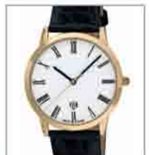
8068PLL from €84