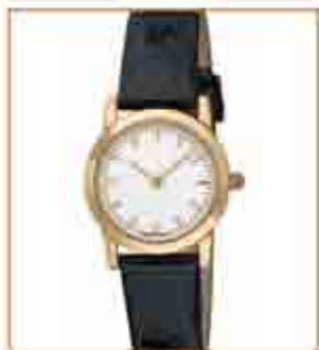
8070PLL from €79

Stainless steel, bicolor or plated case • 30 m water-resistant • Quartz movement • Date (Gents) • Leather strap or solid stainless steel bracelet