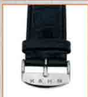
6 Personal logo on buckle Logo auf Schliesse Logo sur boucle from € 5.00