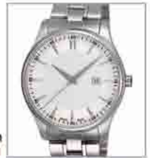
8052STM from €91