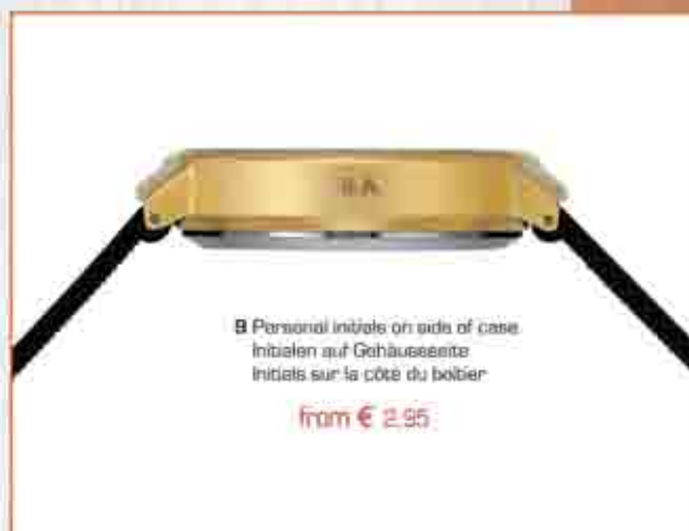
9 Personal initials on side of case Initialen auf Gehäuseseite Initials sur la côté du boîtier from € 2.95