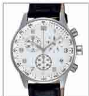
8054STL from €92