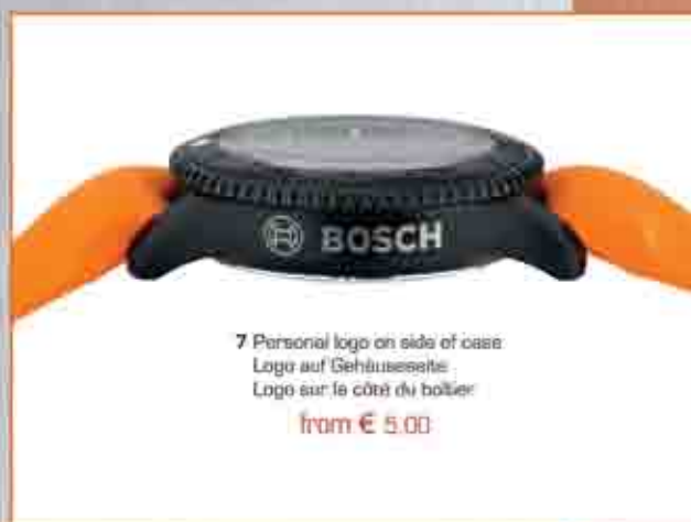
7 Personal logo on side of case Logo auf Gehäuseseite Logo sur le côté du boîtier from € 5.00