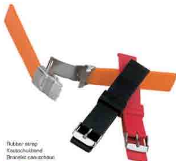
Rubber strap Kautschukband Bracelet caoutchouc € 5.00