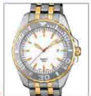
80258IM from €70