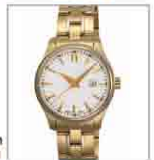
8053PLM from €81