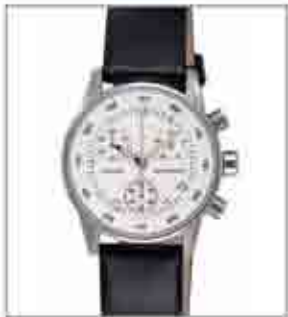
80405TL [Lady] from €92