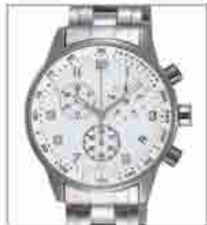
8054STM from €110