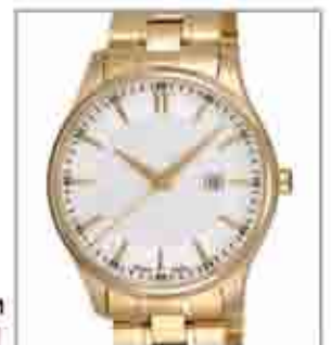
8052PLM from €81