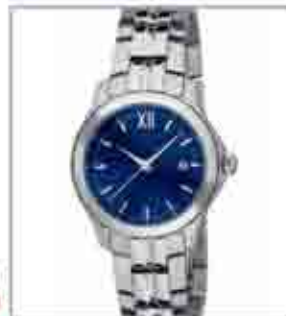
8066STM from €79