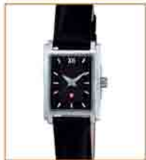
8005STL from €61