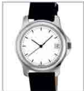
2419STL from €38