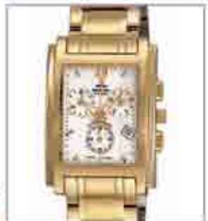
8006PLM from €126