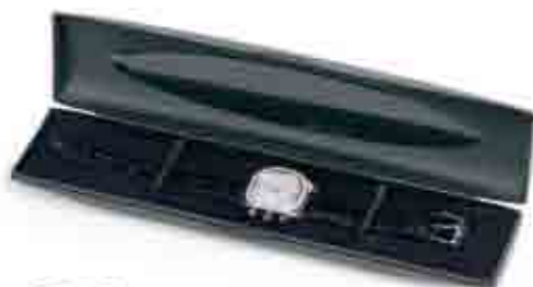
3 Black Box Schwarzes Etui Etui noir Included