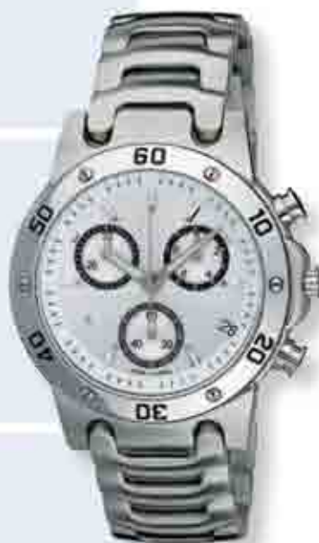
8062STM [1:1] from €129