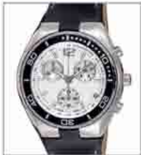
8037STL from €99