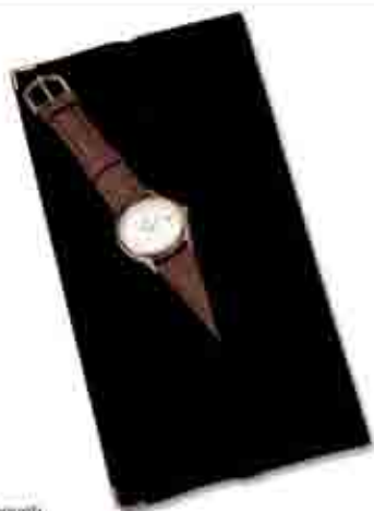
1 Black velvet pouch Schwarze Pochette Pochette noir Included