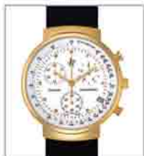
7914PLL from €95