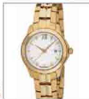
8066PLM from €99