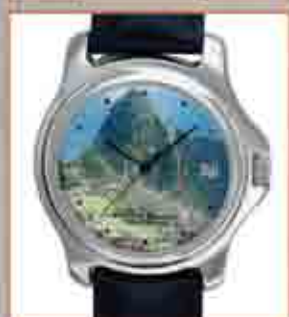
3 Photo Dial Photo Zifferblatt Gedruckte photo Minimum Quantity 1000 pieces