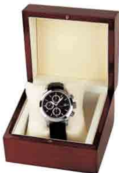
6 Wooden Box Holzbox Etui en bois € 10,00