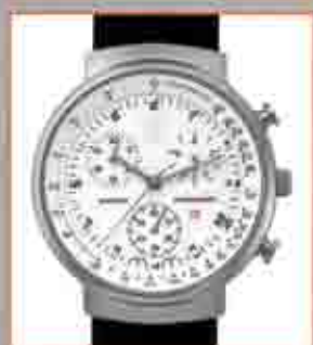
2 Colourful Logo printing Farbloses Logo Logo anse couleur Minimum Quantity 250 pieces