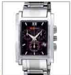
8006STM from €116