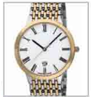
8068BIM from €102