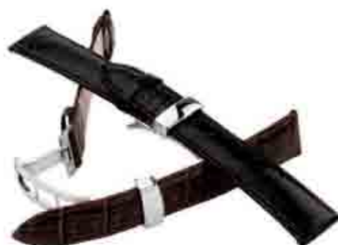
Leather strap with butterfly buckle Lederband mit Fallschleese Bracelet cuir avec fermoir déployant € 5.00