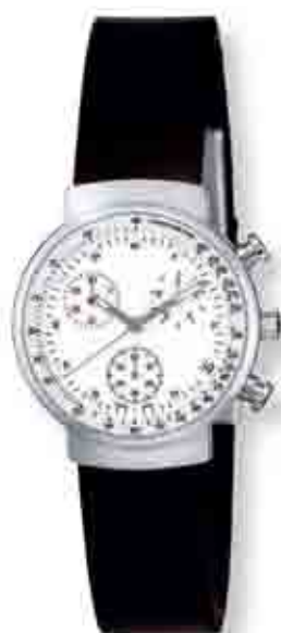
7997STL [Lady, 1:1] from €89