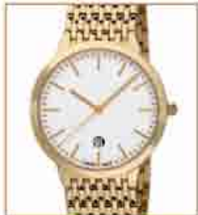
8068PLM from €108