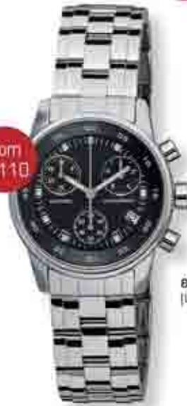
80405TM [Lady, 1:1]