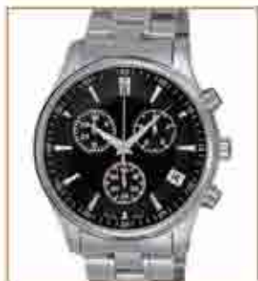
8051STM from €109

Chronographe • Boîtier acier ou plaqué • Étanche 50 m • Mouvement quartz • Date • Bracelet cuir ou acier solide