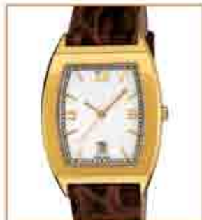
8034PLL from €76