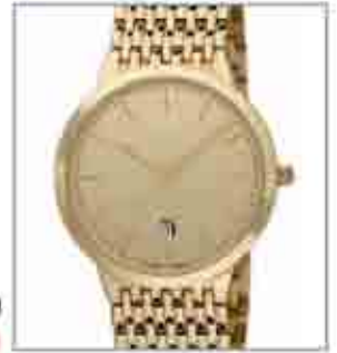
8068PLM from €108