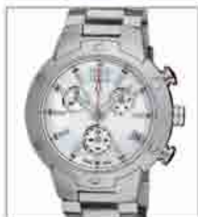
8067STM from €129