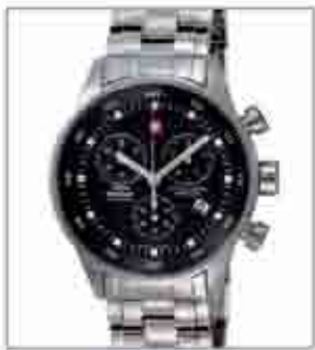
80245TM [Unisex] from €110

Chronographe • Boîtier acier • Etanche 50 m • Mouvement quartz • Date • Bracelet cuir ou acier solide