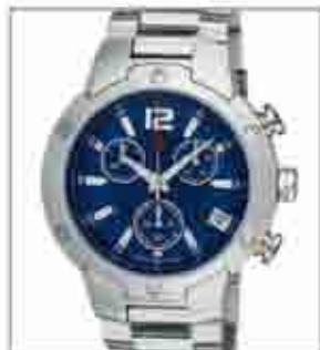
8067STM from €129