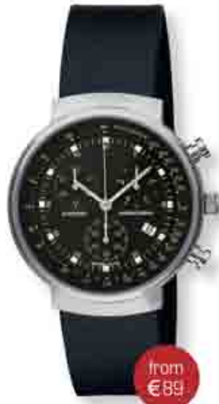
8055STL [Unisex, 1:1]