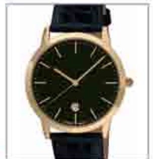
8068PLL from €84