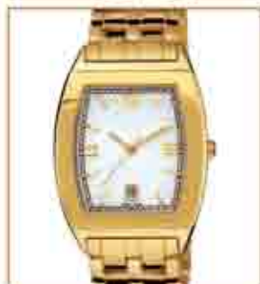
8034PLM from €96