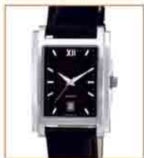
8004STL from €61