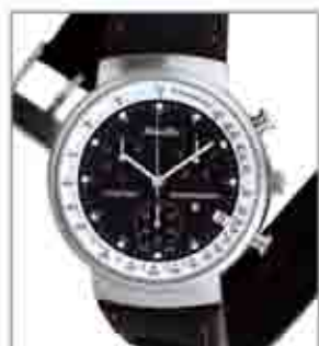
7914STL from €89