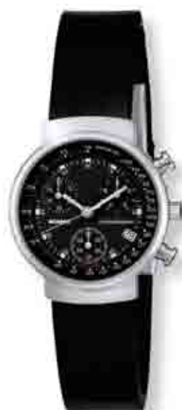
7997STL [Lady, 1:1] from €89

Chronographe • Boîtier acier • Étanche 50 m • Mouvement quartz • Date • Bracelet cuir ou caoutchouc