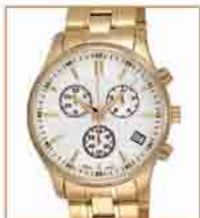
8051PLM from €129