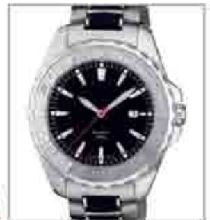
80255TM from €64