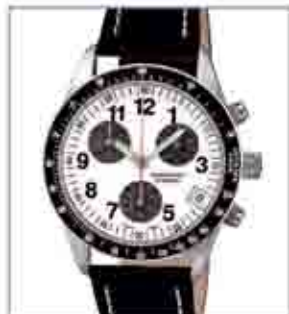
8009STL from €85