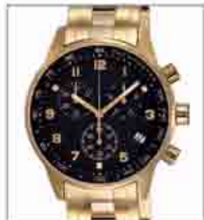
8054PLM from €129