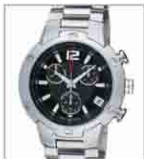
8067STM from €129

Chronographe • Boîtier acier, bicolore ou PVD • Étanche 100 m • Mouvement quartz • Date • Solid bracelet acier ou PVD