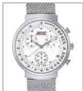
7914STM from €89

Chronographe • Boîtier acier • Étanche 50 m • Mouvement quartz • Date • Bracelet, cuir, acier ou caoutchouc