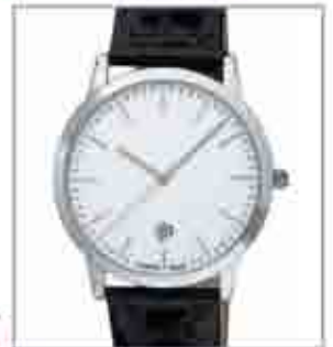
8068STL from €74