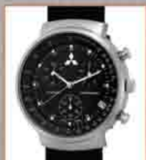
1 Superimposed Dial Emblèmes Logo Logo an appétion Minimum Quantity 100 pieces