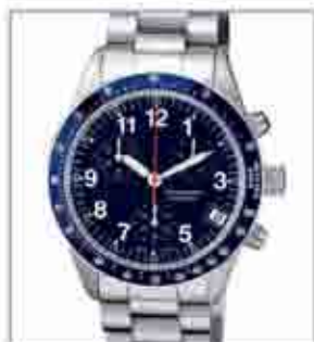
8009STM from €95