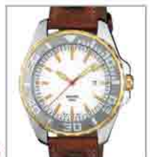
80258IL from €60