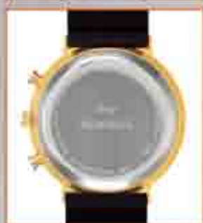
4 Personal name on/and serial number on caseback Persönlicher Name und/oder Seriennummer auf Gehäuseboden Nom ou/et No. de série sur fond from € 2.95