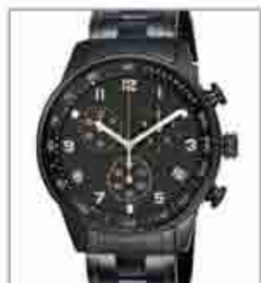
8054BM from €135