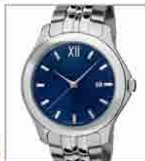
8065STM from €79