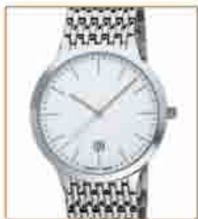
8068STM from €93