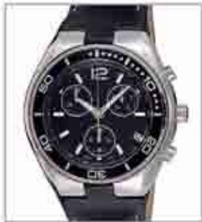
8037STL from €99