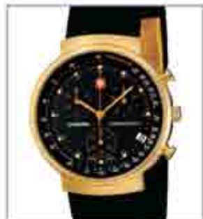
7914PLL from €95