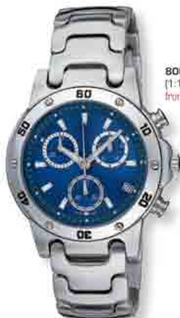
8062STM [1:1] from €129

Chronographe • Boîtier acier • Étanche 100 m • Mouvement quartz • Date • Bracelet acier solid