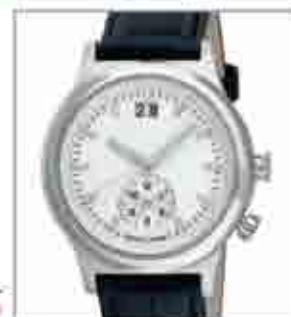
8061STL from €97