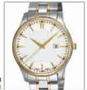
8052BIM from €78