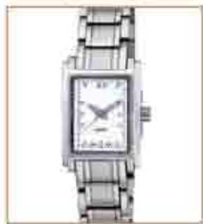
8005STM from €81