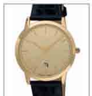
8068PLL from €84