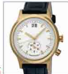
8061PLL from €109