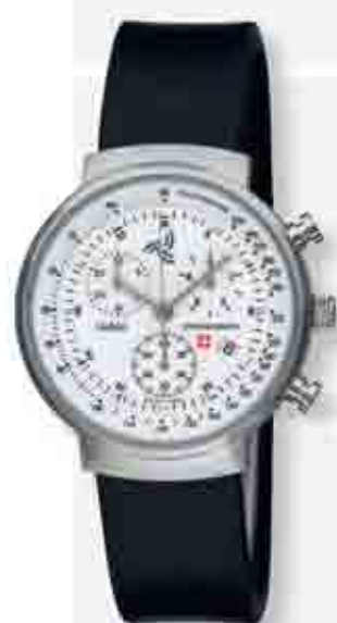
8055STL [Unisex, 1:1] from €89