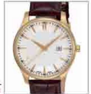
8052PLL from €81