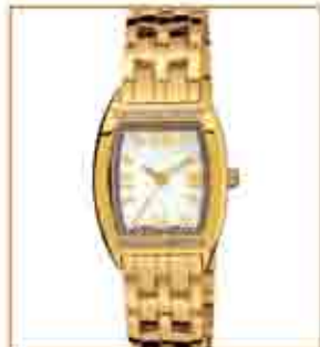
8035PLM from €96