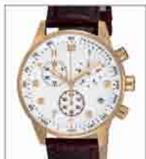
8054PLL from €98