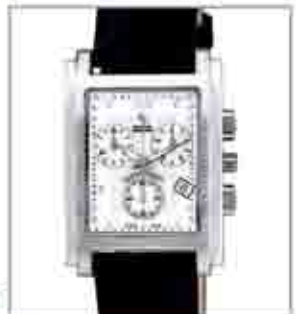
8006STL from €97