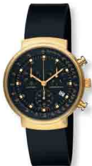
8055PLL [Unisex, 1:1] from €95

Chronographe • Boîtier acier ou plaqué • Étanche 50 m • Mouvement quartz • Date • Bracelet cuir ou caoutchouc