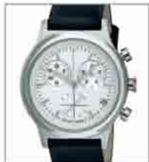
8060STL from €97