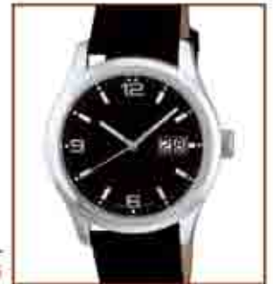
2601STL from €55