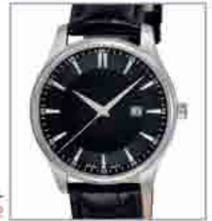
8052STL from €72