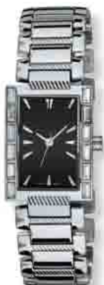
8071STM (1:1) from €85