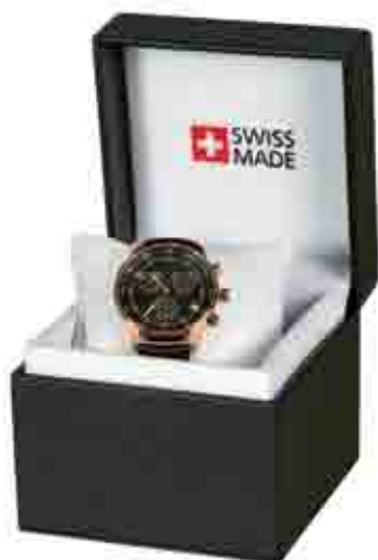
4 Black deluxe Box Schwarzes Deluxe Etui Etui deluxe noir € 5,00