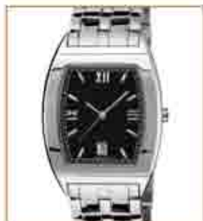
8034STM from €89

Boitier acier ou plaqué • Pierres Swarovski • Étanche 30 m • Mouvement quartz • Date (homme) • Bracelet cuir ou acier solide