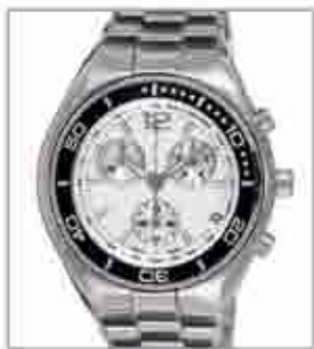
8037STM from €130