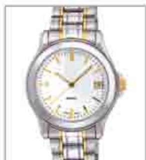
7981BIM from €58