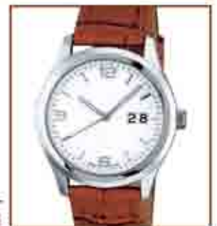
2601STL from €56