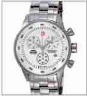
80245TM [Unisex] from €110