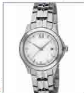
8066STM from €79