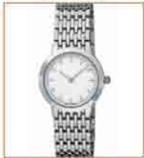
8070STM from €88