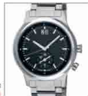
8061STM from €115