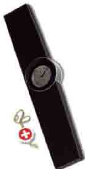
2 Design Box Included