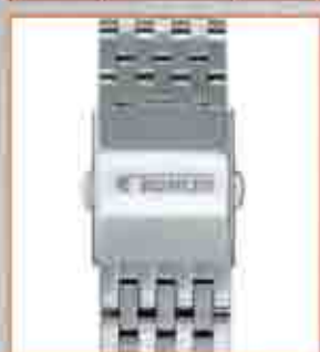
5 Personal logo on buckle Logo auf Verschluss Logo sur fermeture from € 2.95